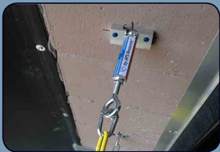
Figure 2: DUAL CHAIN turnbuckle & receiver

The DUAL CHAIN is a set of strengthened security chains used to help protect workers from edge of dock accidents. This protective product is anchored into the door frame, stretches across the dock, adjusted using the unique turnbuckles and secured in corresponding receivers. The DUAL CHAIN is a cost effective, easily installed barrier option.