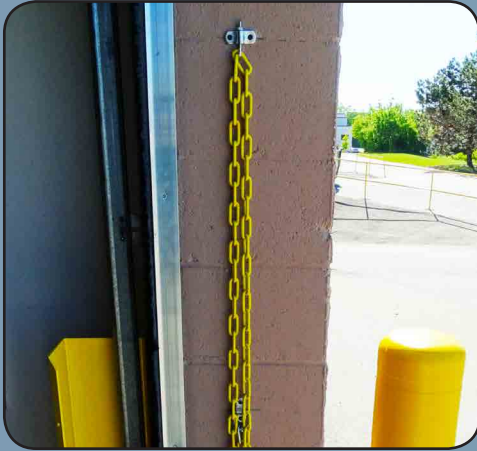
Figure 1: DUAL CHAIN suspended from J-Bolt

The DUAL CHAIN is a set of strengthened security chains used to help protect workers from edge of dock accidents. This protective product is anchored into the door frame, stretches across the dock, adjusted using the unique turnbuckles and secured in corresponding receivers. The DUAL CHAIN is a cost effective, easily installed barrier option.